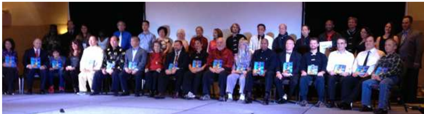
Picture of World Peace Martial Arts -HOF 2014 & 2015.

There is no class on May 25, 2015 (Memorial Day).